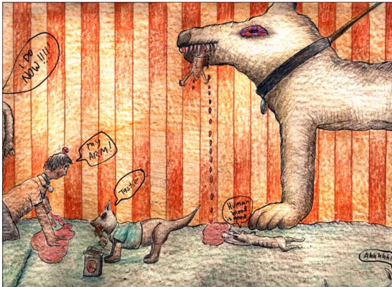
Carnivorous K9